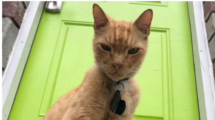
He might not have thumbs, but Killer has a big heart for helping those in need.