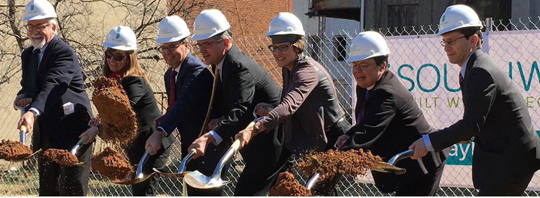
More supportive housing projects are in the works with Episcopal Housing Corporation, hospitals and others.