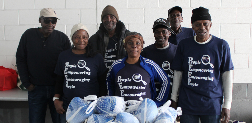
PEEP members celebrate another successful food drive.