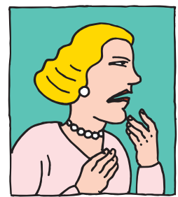
Upset or nervous